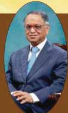
Chairman of the Jury Shri N. R. Narayana Murthy Chief Mentor, Infosys Limited

ICAI AWARDS 2011 : Would honour the exemplary work of Chartered Accountants in Industry by recognizing those who have demonstrated excellence in their professional life, personal life and are the role models for others in industry. These ICAI Awards 2011 also seek to acknowledge Chartered Accountants who have created value to their company's stakeholders on a sustainable basis. Last date for receiving the Nomination Forms is 17 th November 2011.